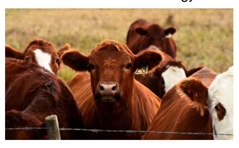
Rabies Global Strategic Plan