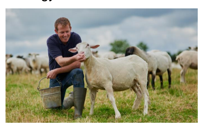
GF-TADs initiative for the Global control of ASF