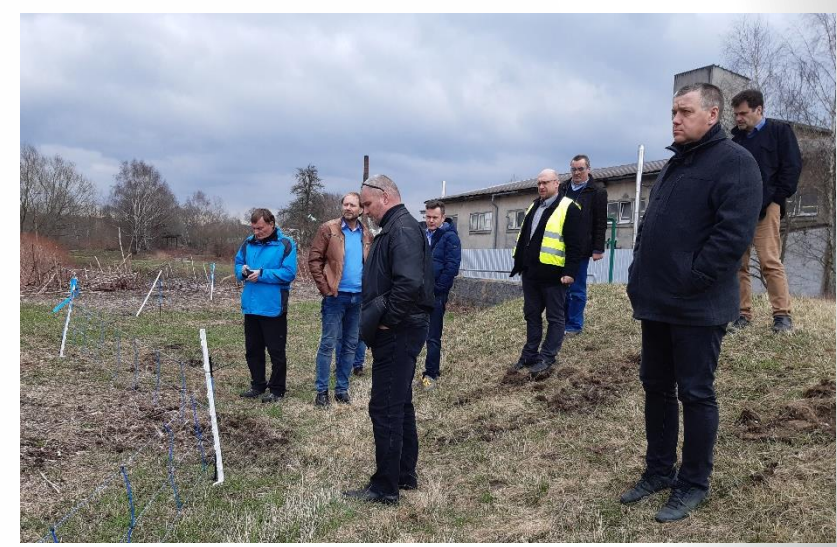
CZ+DE field meeting in 03/2020

Cross border collaboration on all levels