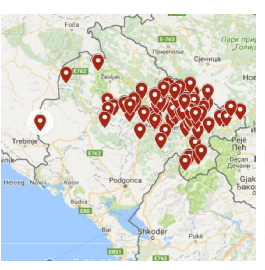
Outbreaks map LSD MNE