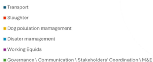
Budget of the 4 th Action Plan - 2024

The meeting also enabled to present an overview of the 4th Action Plan Budget, including the level of disbursement and distribution by topics (see on the right a brief overview of the 2024 budget distribution).