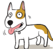
Panting when not hot or thirsty