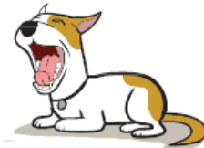
Acting Sleepy or Yawning when they shouldn't be tired