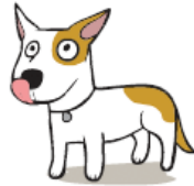
Licking Lips when no food nearby