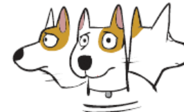
Hypervigilant looking in many directions