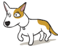
Moving in Slow Motion walking slow on floor