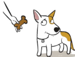
Suddenly Won't Eat but was hungry earlier