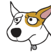
Brow Furrowed, Ears to Side