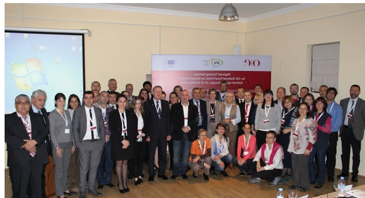
Kakheti, Georgia 13-15 October 2015

The aim of this programme is to provide good governance concepts for improving animal health, animal welfare and food safety of animal origin products at national, regional and international level, and to explain and clarify the role and responsibilities of WOAHA National Focal Points within WOAHA activities.