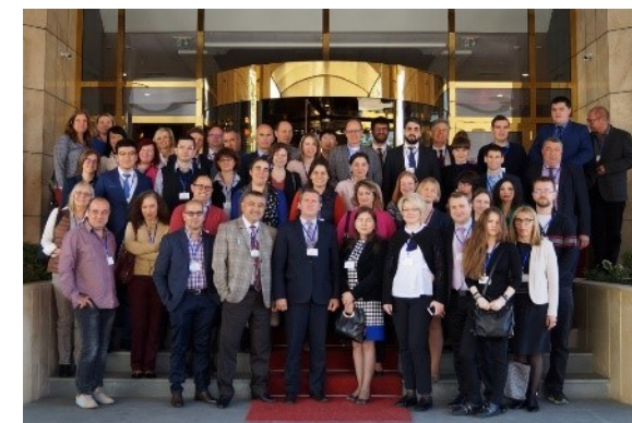
The Hague, The Netherlands 18-20 June 2019