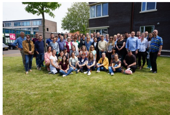
Chisinau, Moldova 25-27 April 2017