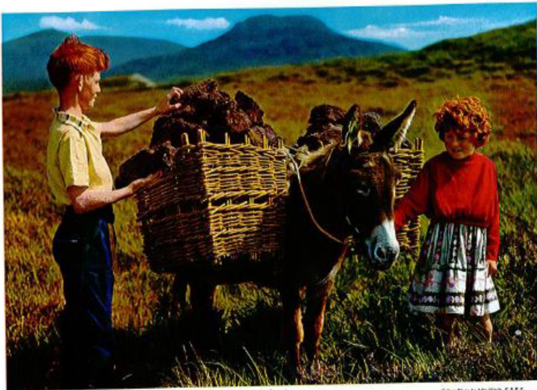
Collecting Turf from the Bog, Connemara, Co. Galway, Ireland.