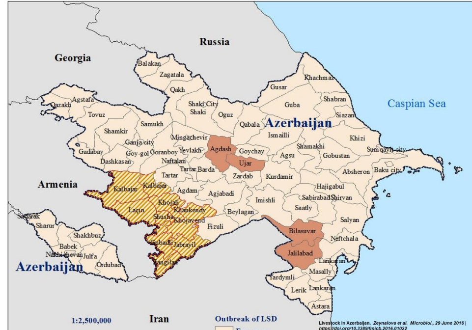
Rayons with suspect or confirmed LSDV infections in cattle reported during 2014