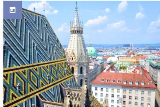
FROM 20/12/2017 TO 21/12/2017 RCG4 - 4th meeting of the Regional Core Group...