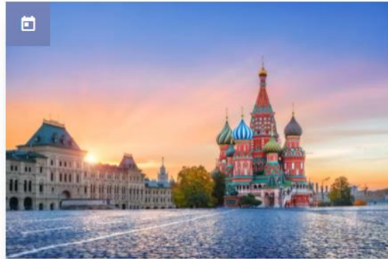
FROM 17/04/2018 TO 18/04/2018 RCG5 - 5th meeting of the Regional Core Group...