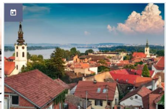
FROM 20/12/2016 TO 21/12/2016 RCG1 - 1st meeting of the Regional Core Group...