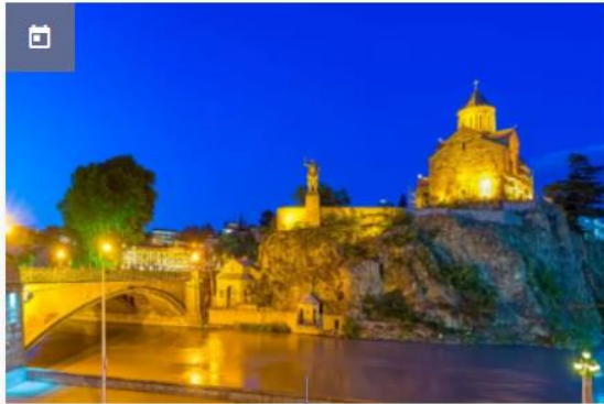
17/09/2018 RCG6 - 6th meeting of the Regional Core Group...