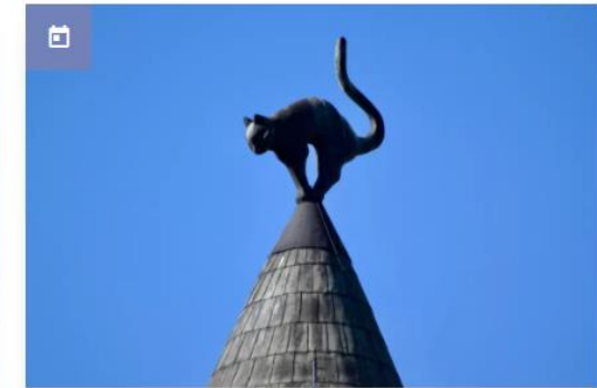
FROM 18/04/2017 TO 19/04/2017 RCG2 - 2nd meeting of the Regional Core Group...