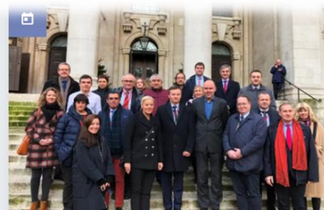
FROM 02/12/2019 TO 03/12/2019 RCG10 – 10th meeting of the Regional Core Gro...