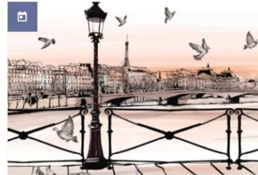
21/05/2017 RCG3 - 3rd meeting of the Regional Core Group...

https://www.youtube.com/watch?v=RoUCCGLLeAtk