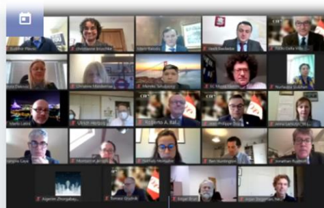
20/01/2021 RCG12 – 12th meeting of the Regional Core Gro...