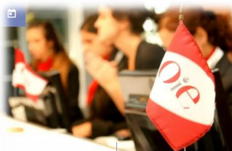
20/05/2021 RCG14 – 14th meeting of the Regional Core Gro...