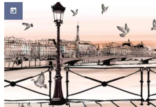
23/02/2017 RCG TC-2017 - Teleconference of the Regional ...