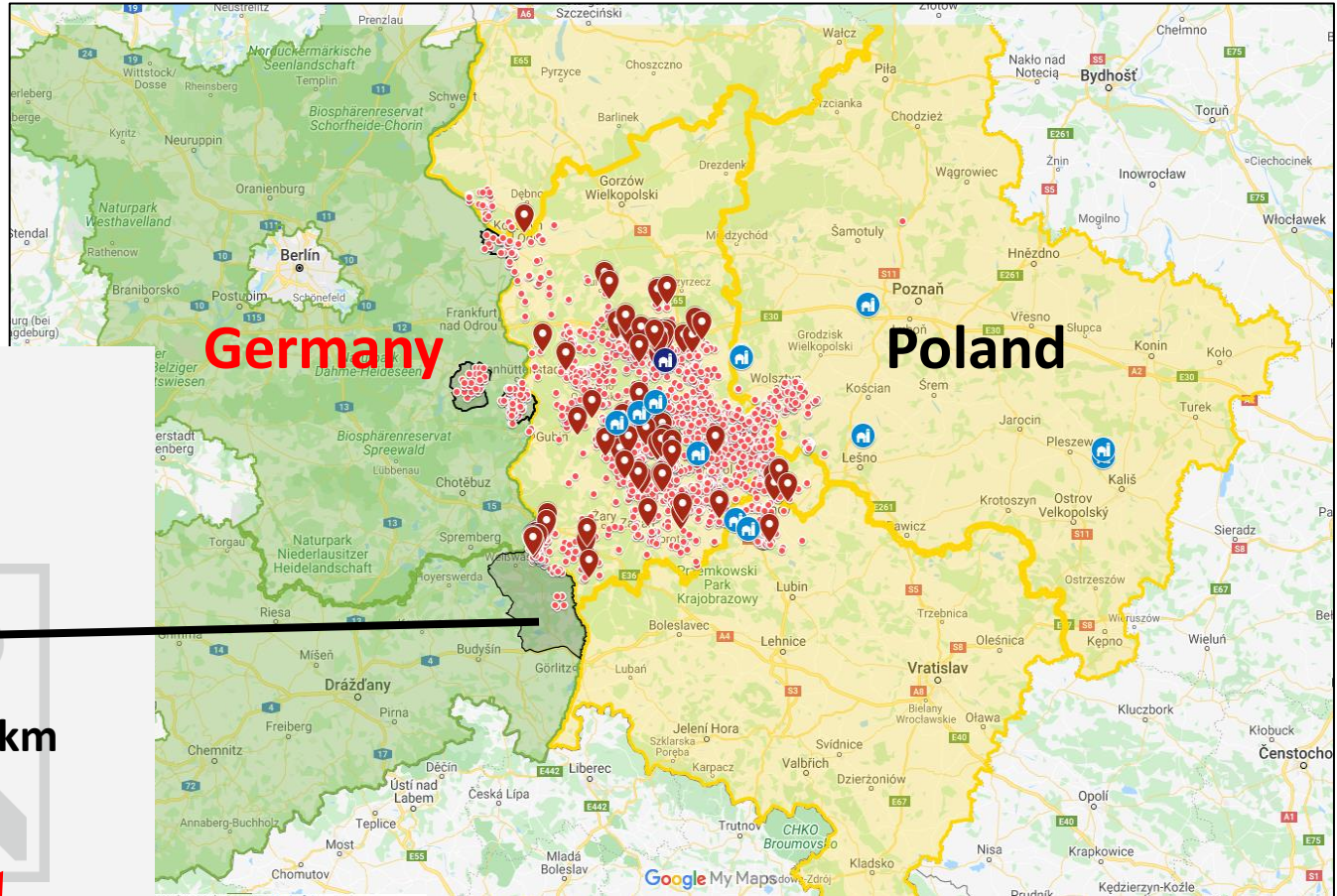
Positive cases in Germany (in red), 30 km from the border.