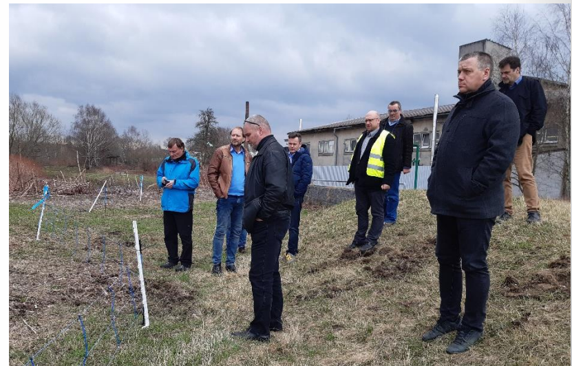
CZ+DE field meeting in 03/2020

Cross border collaboration on all levels