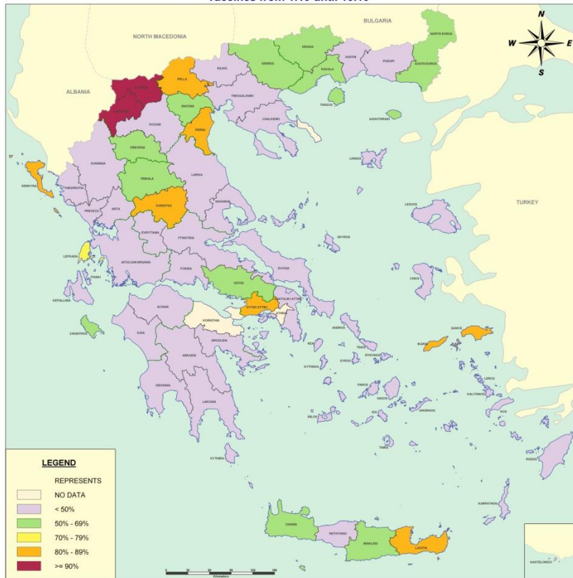
Vaccination Campaign in Greece (Oct. 2019) vaccines from 1.19 until 10.19