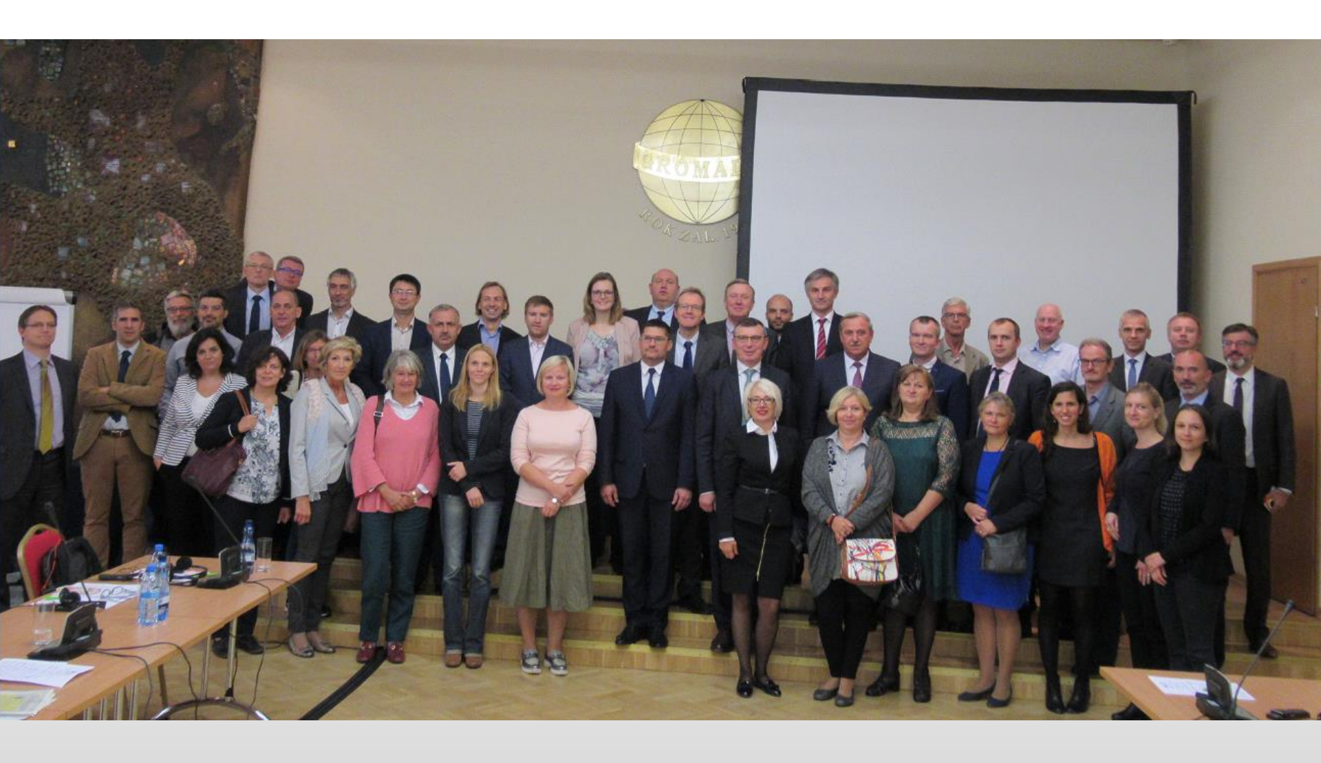
Warsaw, September 2018